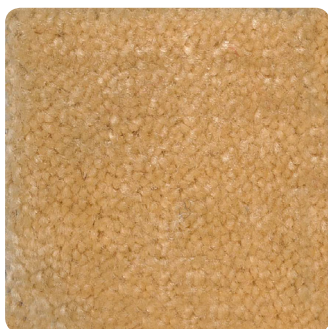
496 PEACH TAN