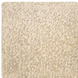
495 ALMOND BEIGE