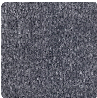
723 POODLE GREY