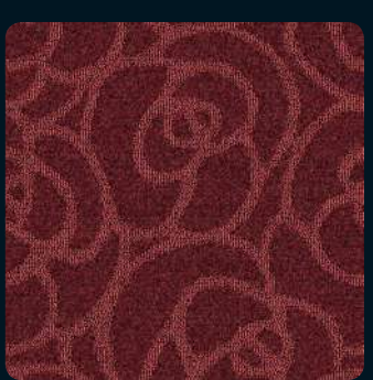
F333 - DIVINE RED