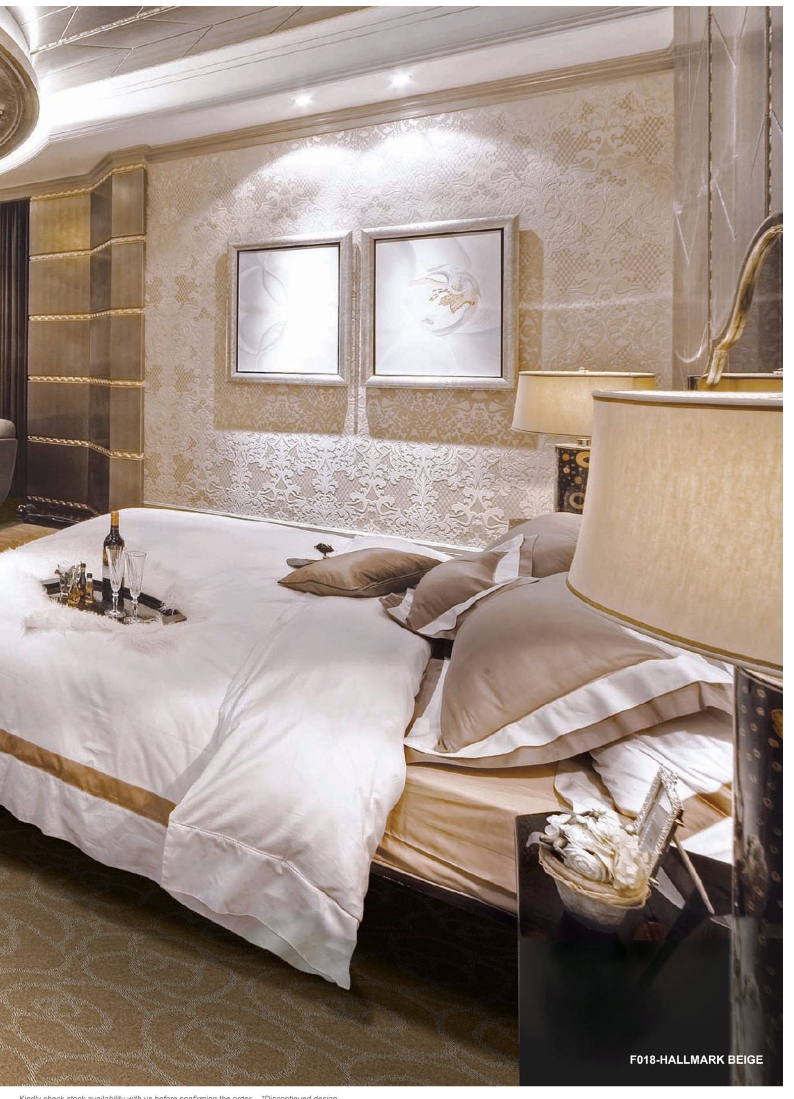
\textit{Kindly check stock availability with us before confirming the order.} \quad \text{``Discontinued design.}