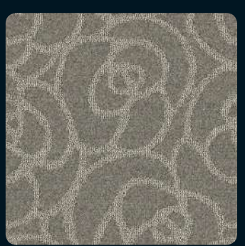
F089 - STYLISH GREY