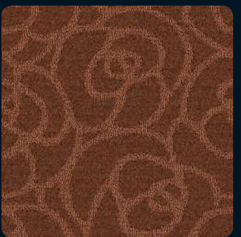
F081 - LOVELY BROWN