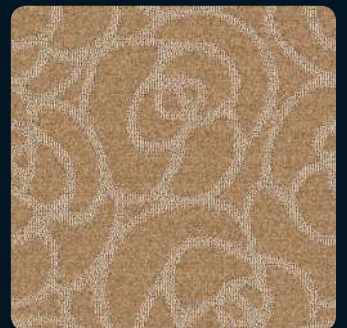
F018 - HALLMARK BEIGE