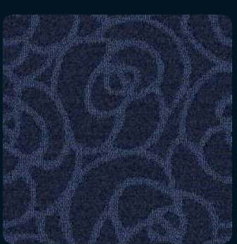
F1160 - MODISH BLUE