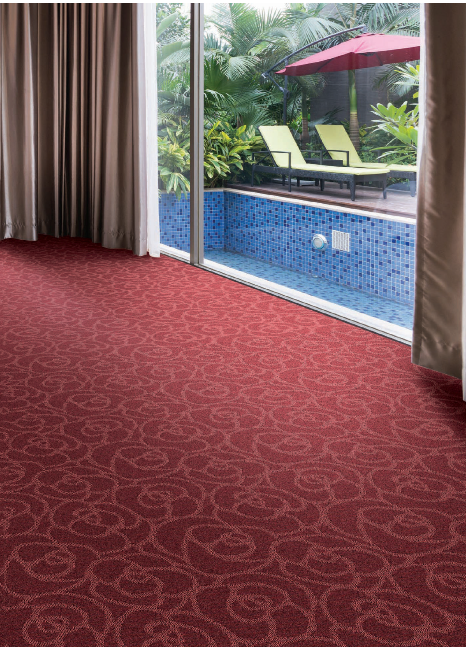
Kindly check stock availability with us before confirming the order. *Discontinued design.