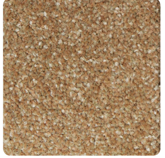
367 MEDIUM BEIGE