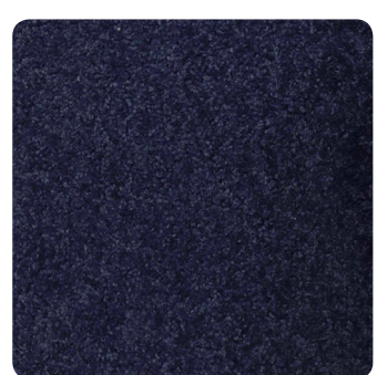
700 DARK BLUE