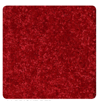
501 BRIGHT RED