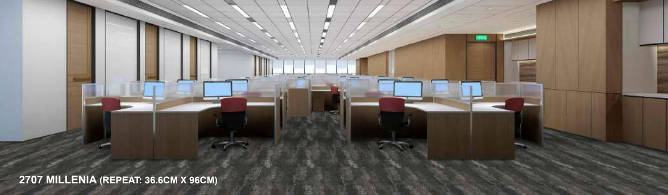
2707 MILLENIA (REPEAT: 36.6CM X 96CM)