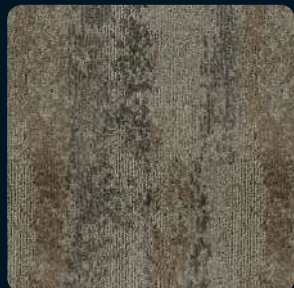
2702 PACIFIC REPEAT: 36.6CM X 100CM