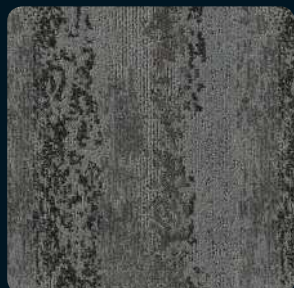
2704 EXCELSIOR REPEAT: 36.6CM X 100CM