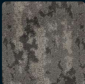
2602 PARK ROYAL REPEAT: 36.6CM X 96CM