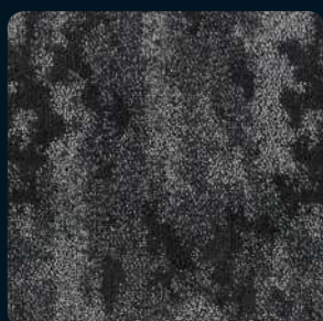
2609 SHANGRI-LA REPEAT: 36.6CM X 96CM