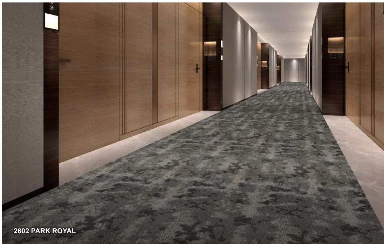
2602 PARK ROYAL