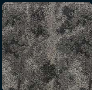
2605 REGENT REPEAT: 36.6CM X 96CM