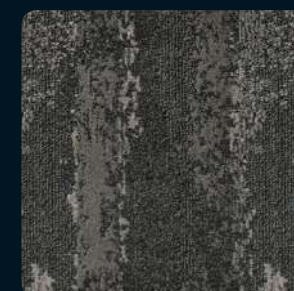
2707 MILLENIA REPEAT: 36.6CM X 100CM