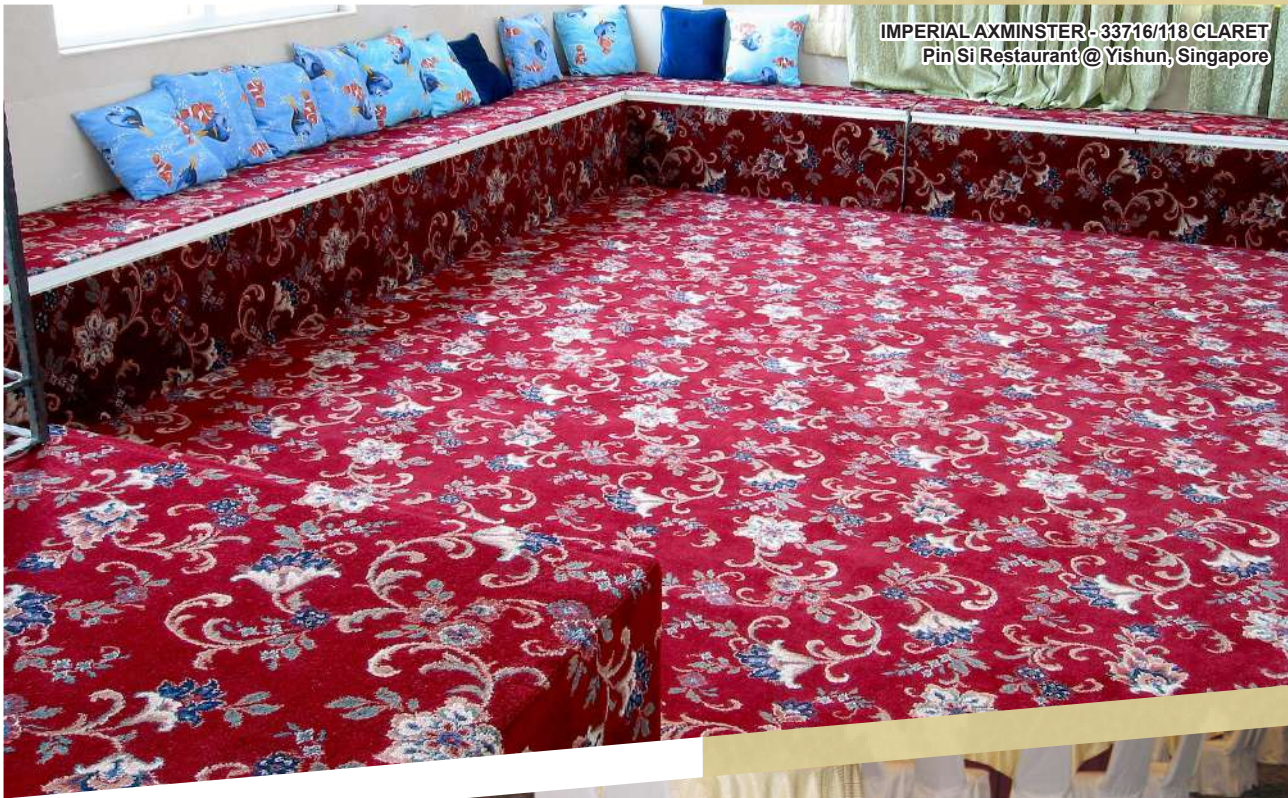
IMPERIAL AXMINSTER - 33716/118 CLARET Pin Si Restaurant @ Yishun, Singapore