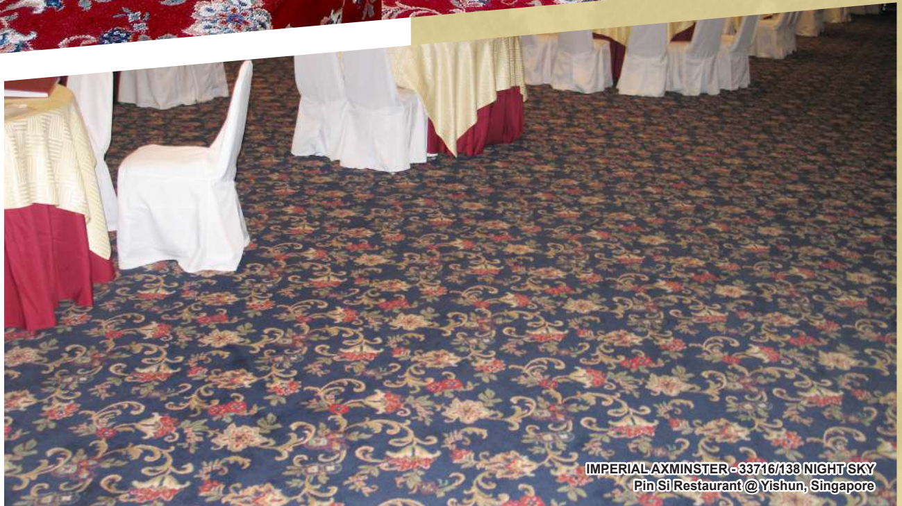
IMPERIAL AXMINSTER - 33716/138 NIGHT SKY Pin Si Restaurant @ Yishun, Singapore