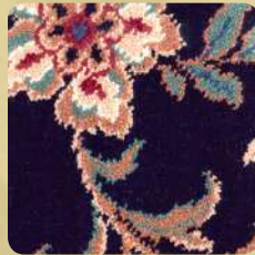
3716-138 NIGHT SKY