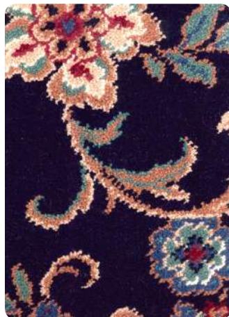
3716/138 NIGHT SKY